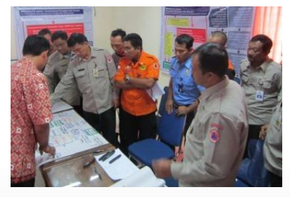
Discussion of SOPs

The Warning Service Training Module was developed in close cooperation with BMKG and implemented in a joint program together with our Partners from the BPBDs and working groups at provincial and district level in Sumatra, Java, Bali and NTB as well as the national and regional offices of BMKG.