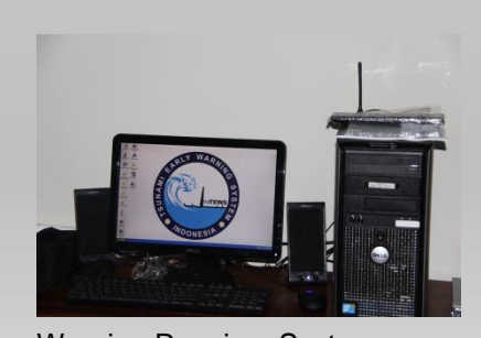
Warning Receiver System