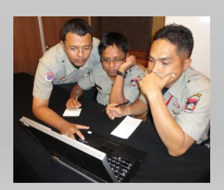
Practical Exercise on WRS